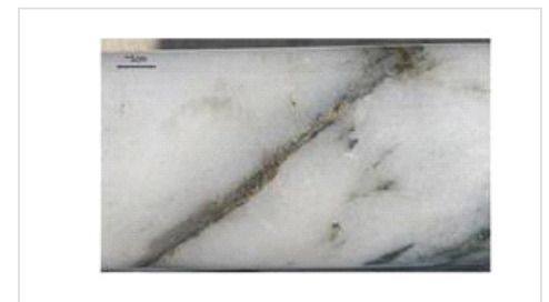
VG in Core From Falcon Zone