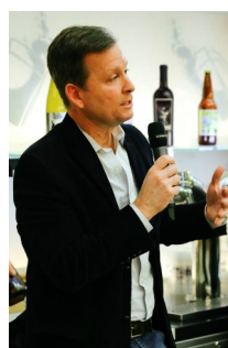
Bill Newlands President and Chief Executive Officer

"Our strong performance drove record cash flow results which we used to reduce debt to our targeted leverage range while returning value to shareholders through dividends and share repurchases. In this time of uncertainty, we believe we have ample liquidity and financial flexibility and remain committed to our investment grade rating. We have significant capacity under our $2 billion revolving credit facility and we plan to carefully manage our debt position over the next 24 months. In addition, we are expecting approximately $850 million in cash upon the close of the Gallo transaction and we remain focused on prudently navigating the challenging operating environment presented by COVID-19."