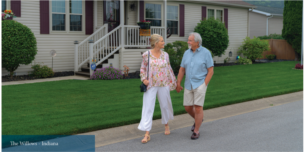
The Willows - Indiana