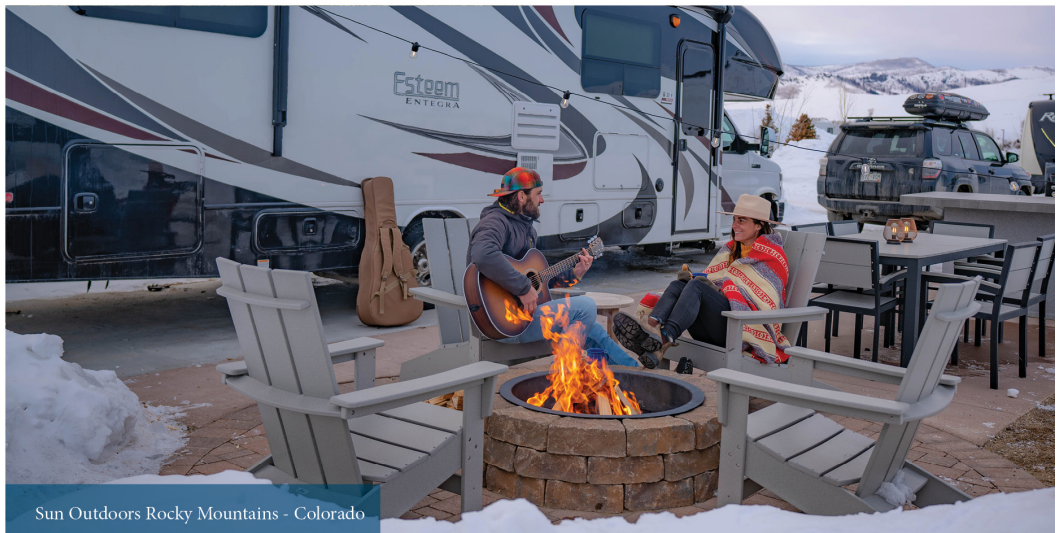
Sun Outdoors Rocky Mountains - Colorado