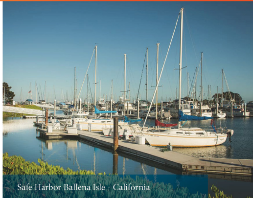
Safe Harbor Ballena Isle - California