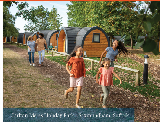
Carlton Meres Holiday Park - Saxmundham, Suffolk