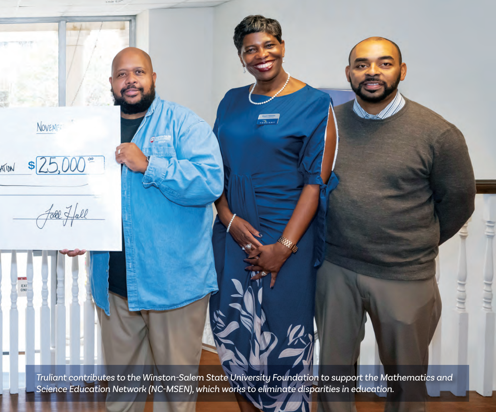
Truliant contributes to the Winston-Salem State University Foundation to support the Mathematics and Science Education Network (NC-MSEN), which works to eliminate disparities in education.

Truliant's Corporate Social Responsibility efforts recognize the impact they are having on all aspects of society, including economic, social, and environmental.