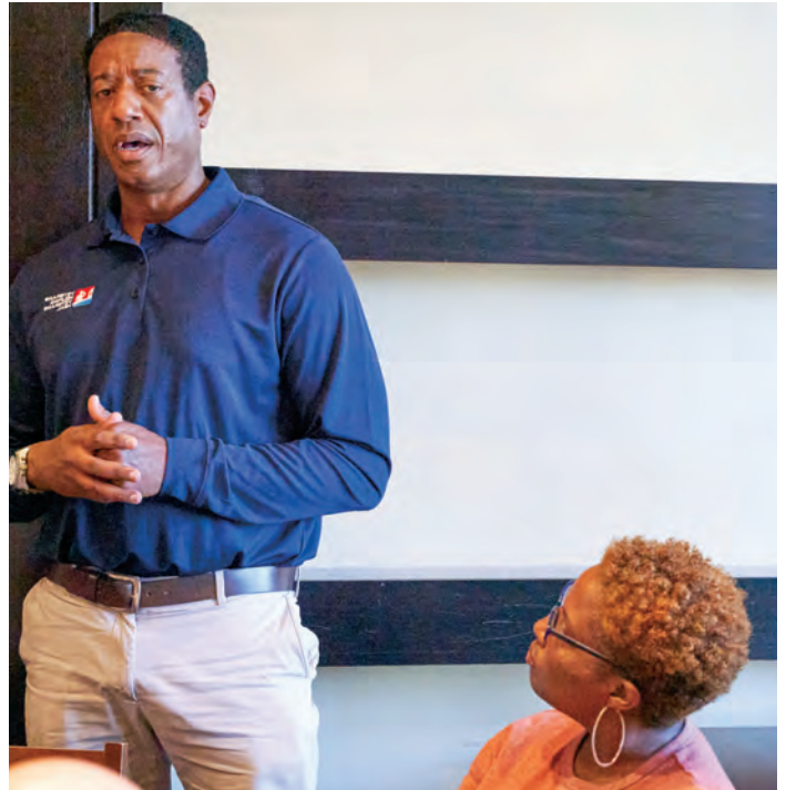
Officials with Veterans Helping Veterans Heal of Winston-Salem (VHVH) talk about programs to help homeless veterans transition to independent living. The Truliant Foundation made a donation to the VHVH during a luncheon honoring employees who served in the Armed Forces.

BRGs build awareness through education and activities that increase belonging. As a financial institution with a mission of “people helping people,” we believe our employees’ unique experiences, cultures and perspectives are a cultural point of difference.