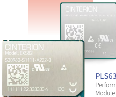
EXS82-W Global MTC Module

The multiple sandboxing capabilities introduced by containerization simplify software content management, reduces software update payload and enable on-the-go application updates for future-proof, reliable cellular connectivity.