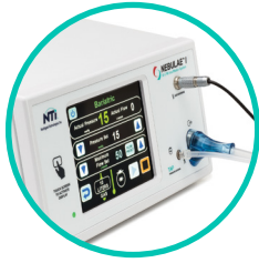
NEBULAE™ I Laparoscopic Insufflator