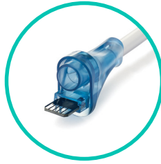
NEBULAE™ High- flow Insufflation Tubing Set