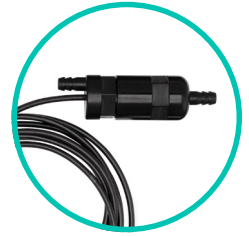
NEBULAE™ In-line CO 2 Gas Warmer