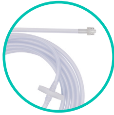
NEBULAE™ TAP Sensing Tubing Set