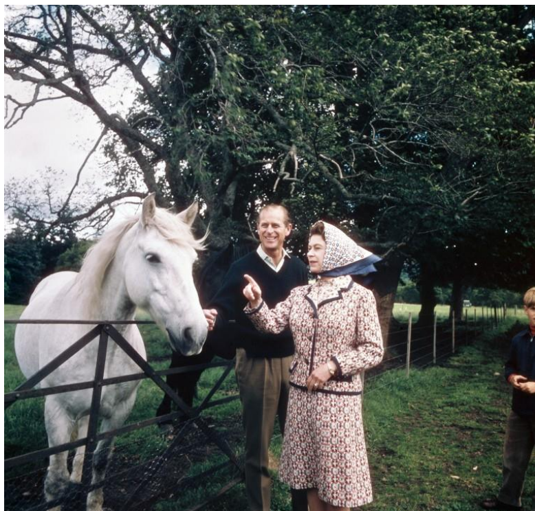
Queen Elizabeth II and Prince Philip visit a farm on the Balmoral estate in Scotland around September 1972 during their Silver Wedding anniversary year.

Some months before, my dear friend Monty Roberts, one of Her Majesty’s confidants , had asked me to prepare a document about my life’s work protecting horses. I was grateful for the opportunity and wrote a seven-page story titled “ A Paradigm Shift ,” which shared the tale of how my own life crumbled as a result of my efforts to end horse abuse.