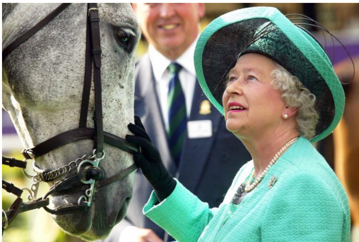
Queen Elizabeth II at the third day of the Royal Windsor Horse Show at Home Park in Windsor, England, on May 15, 2004.

It's been quite strange to have such deep feelings of loss as an American who's never set foot in the United Kingdom. But I've always felt drawn to Queen Elizabeth. I grew up watching her on television and knew who she was long before I knew the name of the U.S. president. Like the Cullinan diamond , which graces the top of the Sovereign's Scepter With Cross , Queen Elizabeth II was to so many people around the globe our rock and the brightest shining star on our planet.