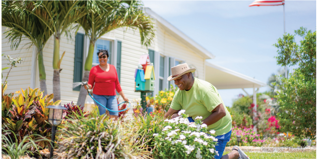
Park Place - Florida