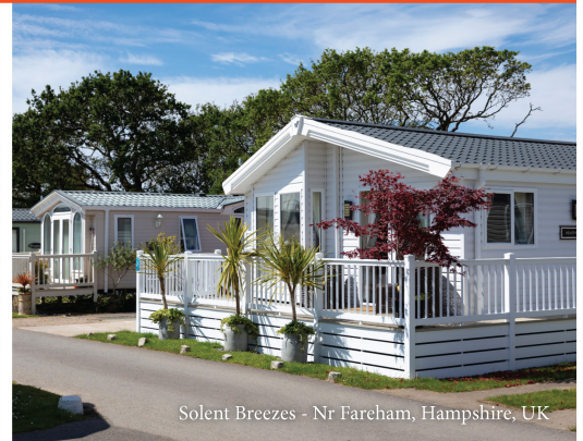
Solent Breezes - Nr Fareham, Hampshire, UK