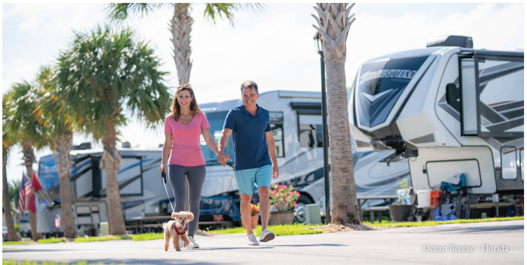
Ocean Breeze - Florida