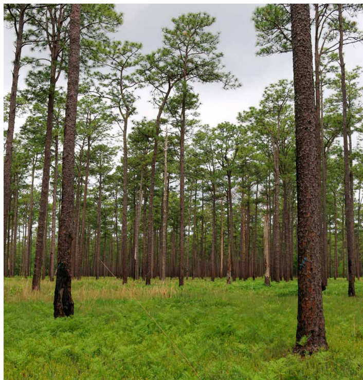
Longleaf pine forest

Restore and enhance nearly 5,000 acres of longleaf pine on private lands within priority counties for longleaf pine and northern bobwhite quail restoration in Alabama. Project will engage at least 100 private landowners through targeted outreach and technical assistance and assist landowners with