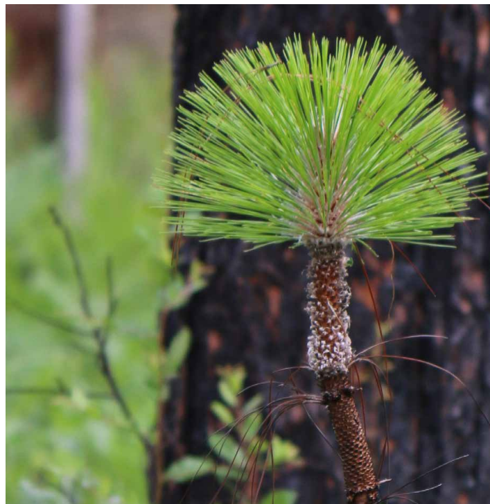
Young longleaf pine

Identify and engage at least 40 landowners through wildlife and forestry technical assistance to restore and