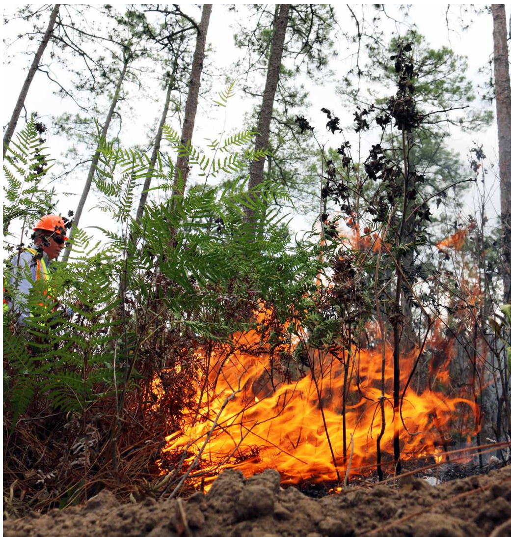
Prescribed burning in a longleaf pine forest

1133 15th Street, NW Suite 1000 Washington, D.C., 20005 202-857-0166