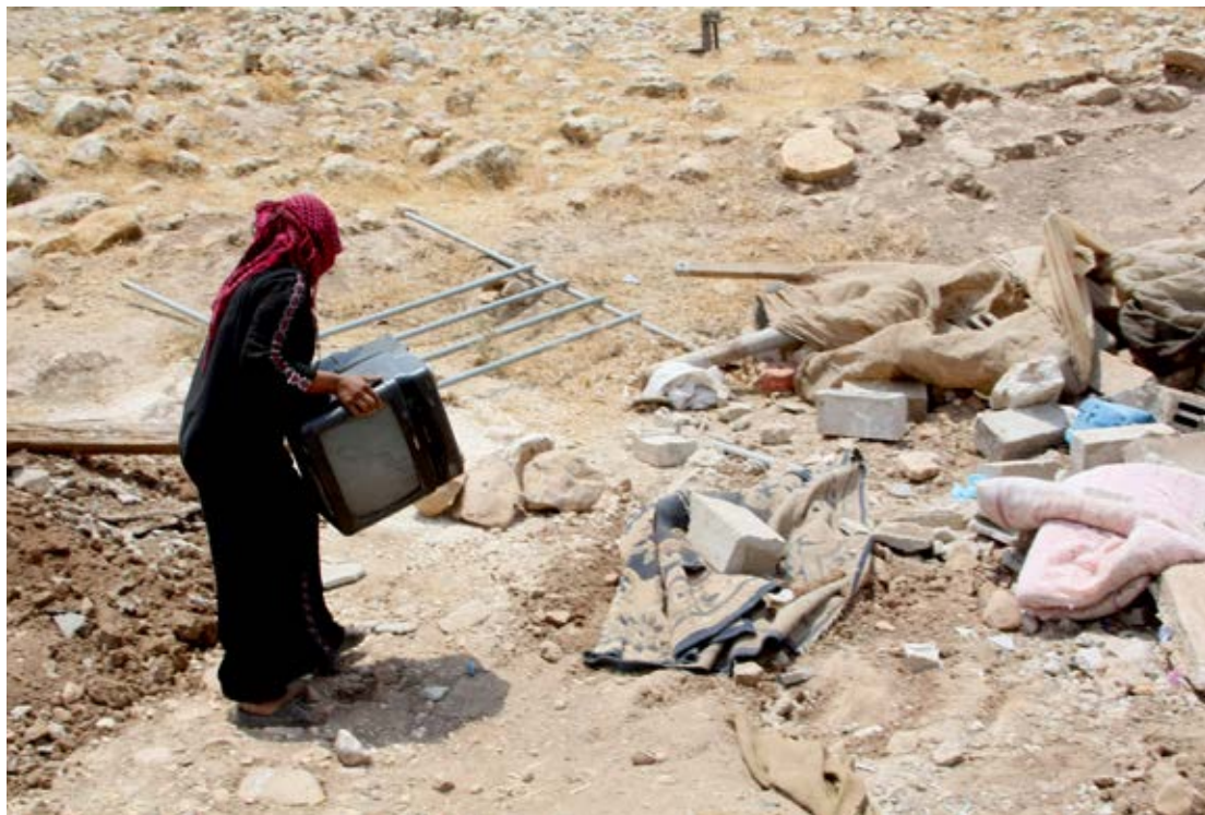
Children inspect the wreckage after Israeli authorities demolished a number of Palestinian homes built without a permit in the village of Umm Al-Khair in the occupied West Bank, on 9 August 2016