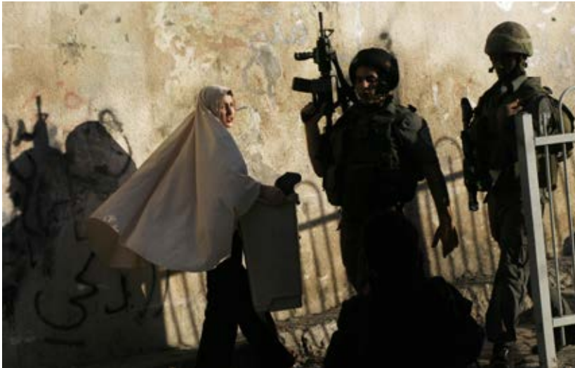
← A Palestinian woman walks past Israeli border policemen during the demolition of a Palestinian house by Jerusalem municipality workers in the Silwan neighbourhood of occupied East Jerusalem, on 5 November 2008

Jewish settlements, houses and compounds in the heart of Palestinian neighbourhoods have a disastrous impact not only on the displaced Palestinian families, but also on the entire neighbourhood and daily life of the Palestinians. Settlers are usually armed, and their compounds are fenced and protected by private security companies, which leads to friction with the local Palestinians. In several cases, these tensions have led to violent confrontations that usually end with the arrest and injury of Palestinians, including children. The settlers' control over land and property in Silwan has also led to the fencing of these sites, blocking passages that served the local Palestinian population and disrupting their lives.