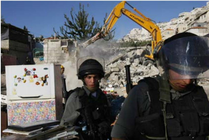
← Israeli policemen guard a bulldozer demolishing a house in the Silwan neighbourhood of occupied East Jerusalem, on 5 November 2008