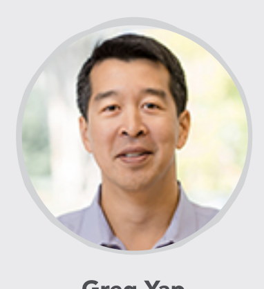
Greg Yap @grgyap Therapeutics, digital health, transformative health tech